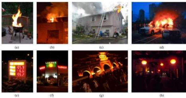
Figure 2: Sample of fire image

G. Laneve et al.,[10] The limits identified with the affectability of the geostationary sensor to fire sizes have been, essentially partially, defeat by presenting explicit calculations. Notwithstanding, the diminished exactness in the geographic localization of the fire, which can, on a basic level, possess any situation in a space of around 16 km 2 (at Mediterranean scopes), makes this data not extremely fascinating for the organizations associated with firefighting. This work investigates the attainability of working on the localization of the warm peculiarities (areas of interest) by consolidating images obtained simultaneously from various MSG satellites situated at various longitudes. Specifically, we consolidate the images obtained by MSG-9 situated at long. 9.0°, MSG-10 situated at 0.0° and MSG-8 situated at long. 41.5°.v.