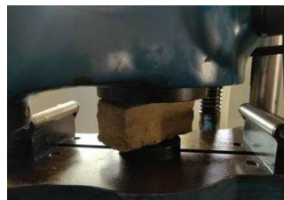
Fig. compressive test analysis