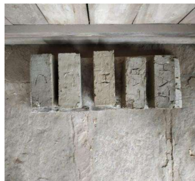
Fig. Drying of brick