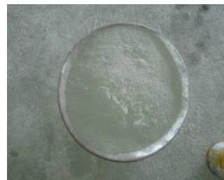
Figure Silica Fume

cement grain. It is available in a water slurry form. It is used at 5% to 12% by mass of supplementary cementitious materials for concrete structures that requires high strength.