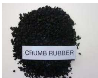
Figure Crumb rubber.

The cracker mill process tears apart or reduces the size of tyre rubber by passing the material 1 between rotating corrugated steel drums. By this process an irregularly shaped torn particles having large surface area are produced. The sizes of these particles vary from 5 mm to 0.5 mm and are commonly known as ground crumb rubber. Granular process shears apart the rubber with revolving steel plates, producing granulated crumb rubber particles, ranging in size from 9.5 mm to 0.5 mm.