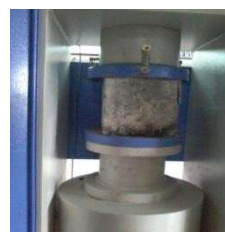
Figure Compressive strength test

Totally 18 concrete cubes were casted and it is allowed for 7 days and 28 days curing. After drying, cubes were tested in Compression Testing Machine (CTM) to determine the ultimate load.