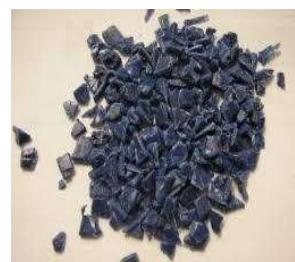
Figure Shredded Tyres

Tyre shreds or chips involve primary and secondary shredding. The size of the tyre shreds produced in the primary shredding process can vary from as large as 300 to 460 mm long by 100 to 230 mm wide, down to as small as 100 to 150 mm in length, depending on the manufacturer's model and condition of the cutting edges. Production of tyre chips, normally sized from 76 mm to 13 mm, requires both primary and secondary shredding to achieve adequate size reduction.