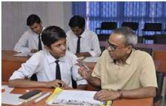
Figure 2. Student Centred Strategy